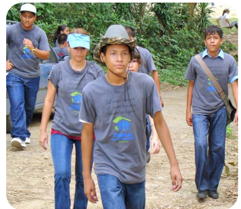
Students carry a sign that highlights Habitat Honduras work with families in need of a home