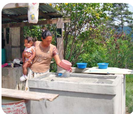
This is part of the besting that realize habitat.